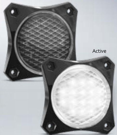
Part No. 88AM2 - Twin Blister